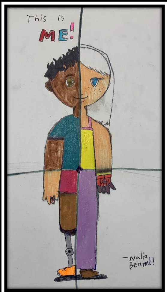
Nalia at Hand Camp